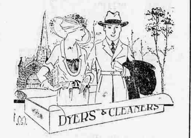
Freshness and Smartness Stand out All the youthful chic which that last year's frock once possessed can be restored—completely.

Go look at that dress you thought hopeless. There is a chance for it. It is never hopeless to us. Save it! Clean it! Freshen it! Wear it! This telephone number will do it. 244.