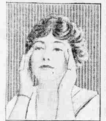
Beautiful actress says, "A short massage with Howard's Buttermilk Cream at night before retiring is all that is necessary." Adv.

Druggists, get a small quantity today with the understanding that the purchase money will be cheerfully refunded to any dissatisfied user.