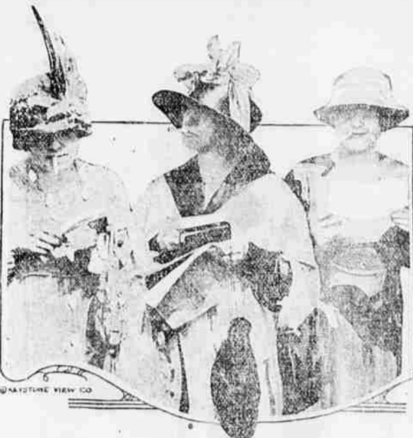
LONDON—No question now whether English women are as naughty as Newport society. Here are three of Britain's smart set having a puff while scanning the face chart at the Goodwood track.