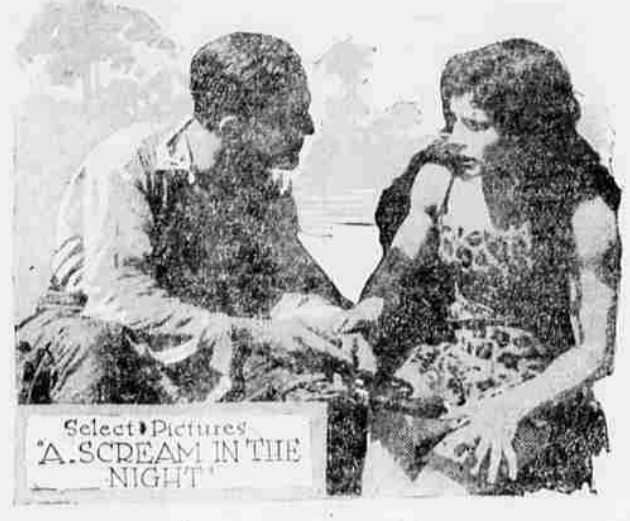
Select Pictures "A SCREAM IN THE NIGHT" at the Riato. The picture achieves its popularity principally by reason of its unique and powerfully dramatic story.