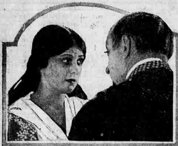
LILA LEE in 'Puppy Love' A Paramount Picture

LILA Lee's new photoplay, "Puppy Love," which is on view at the Liberty theater this week, is a delightfully sweet story, the development of which, recalls the days of youth, the springtime of love of most of us. Miss Lee has a charming role, which she portrays convincingly, and she is splendidly supported by