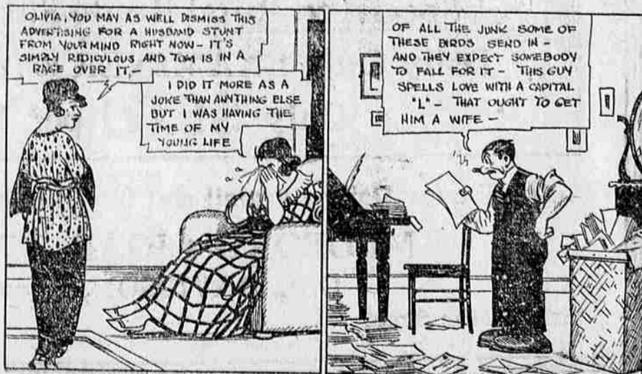
Oliva's Romance Goes Up in Smoke!