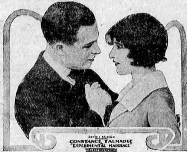
Constance Talmadge who had pleased in such hits as "A Pair of Silk Stockings," "Who Cares," "Romance of Arabella" and others, makes her greatest success in "Experimental Marriage." Last time tonight.