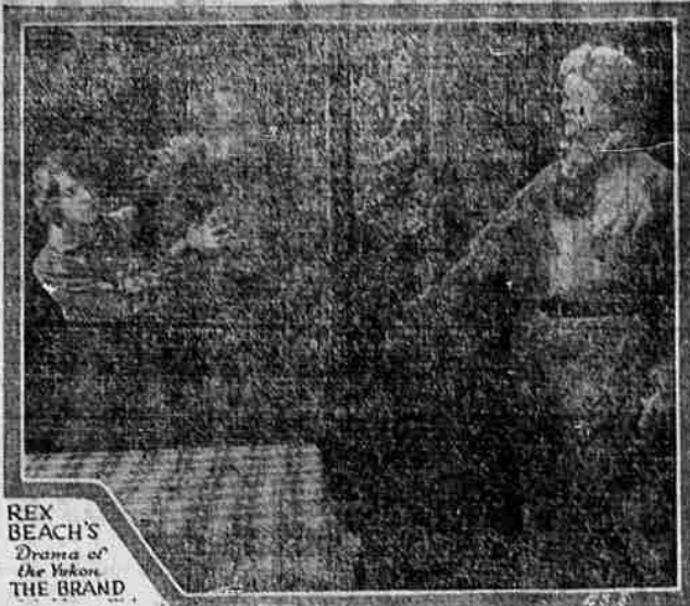
REX BEACH'S Drama of 'The Yukon' THE BRAND