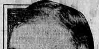
THOMAS NELSON PAGE

Premier Orlando wired home to Italy to protect the American embassy and American interests in that country against any demonstration protesting the stand of President Wilson. Page is the American ambassador to Italy and unless recalled by the extreme action of a diplomatic break will look after the interests of the Americans.