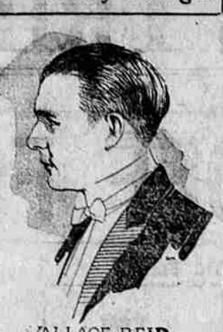
WALLACE REID "The Dub"