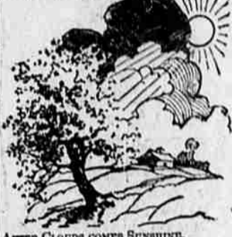
AFTER CLOUDS COMES SUNSHINE. AFTER DEPENDENCY COMES JOY. AFTER SICKNESS COMES HEALTH. AFTER WEAKNESS COMES STRENGTH.

PORTLAND, April 29.—Since an ordinance requiring all handlers of food in grills, restaurants, stores and shops of Portland to subject themselves to examination of the city health officer went into effect January 1, a total of 12,000 men and women have been examined, the health department announced today. For the most part the army of food handlers were found physically fit, but about 200 were required to leave their places of employment for medical treatment.