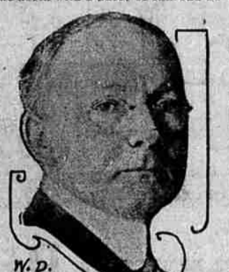
W. D. HINES

PORTLAND, April 22.—"It is my policy and purpose to attempt, so far as possible, to restore railroad service to the sort of service which was rendered before the war," said Walker D. Hines, director general of railroads, who arrived here today from the north with a party of railroad ad-