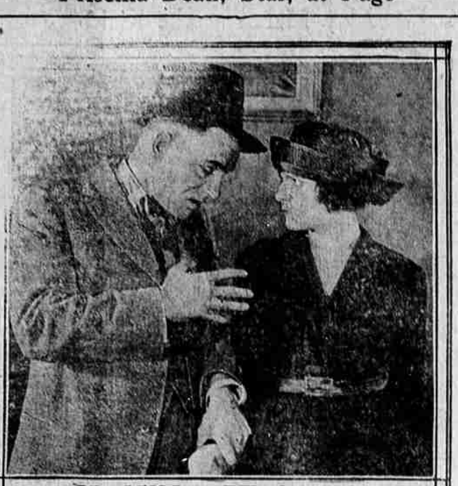
PRISCILLA DEAN in "THE WICKED DARLING"

Priscilla Dean, the fastest rising star in the photoplay firmament, is coming in another of her special attractions. This one is called "The Wicked Darling," and will play the Page theatre today only. Anyone who has not enjoyed this star's vivid and versatile personality has not seen her. And anyone who has not seen