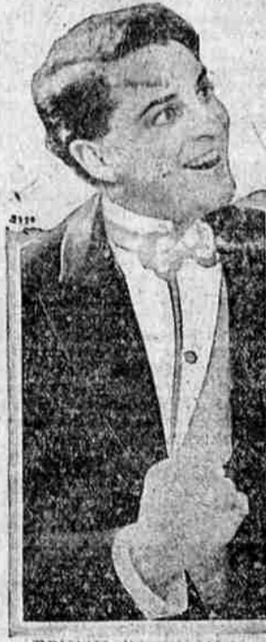
BRYANT WASHBURN in "The Gypsy Trail" at The Liberty

At the Liberty for the last time tonight one of the best comedies ever shown in Medford is Mack Bennett's latest "Whose Little Wife Are You?" Bennett's famous bathing girl, Pete the cat, Teddy, the dog, and with a cast headed by Charles Murray make this comedy a scream from beginning to the end. Bryant Washburn in "The Gypsy Trail" is a beautiful romance story about a girl who wanted a cave-man but not a dress suit.