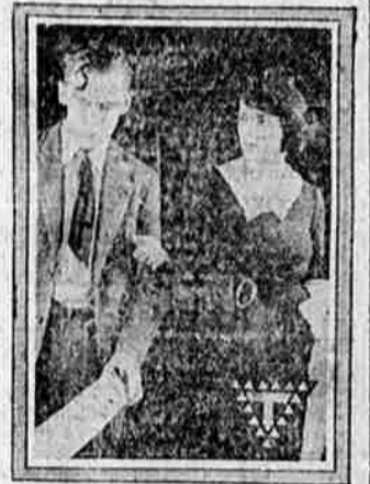
ALMA RUBENS & JACK CONWAY IN TRIANGLE PLAY "RESTLESS SOULS"

If you enjoy an interesting, well told story, one that presents a sympathetic picture of life as it abounds about you, you'll certainly want to see "Restless Souls," now being presented at the Rialto theatre.