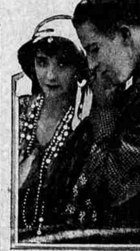
ELSIE FERGUSON in "Under the Greenwood Tree" AN ANTHEATRY PRODUCTION

The story of "Under the Greenwood Tree" is a splendid one and provides Miss Ferguson with a captivating role, that of a jaded English society woman of vast wealth who, longing for the simple life, buys a gypsy outfit and lives in the woods alone with her secretary, a romantic young woman. The simple life is well enough until she meets a young Englishman who, under the impression that she is a real gypsy, woos and wins her. Her leading man is Eugene O'Brien, an actor of reputation. This film will be shown for the last time tonight.