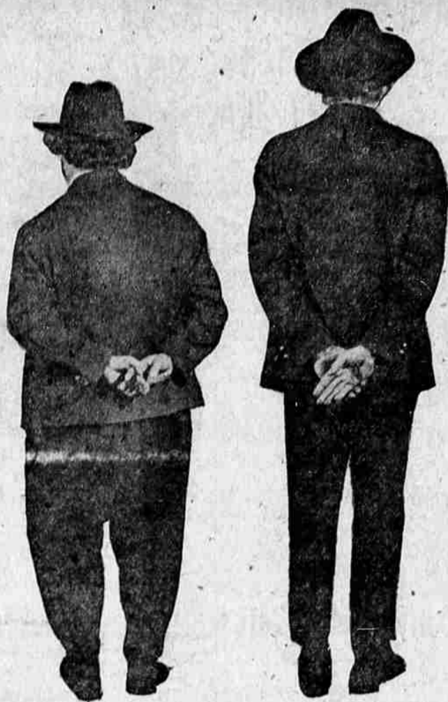
Meet them face to face at the Page Thursday night