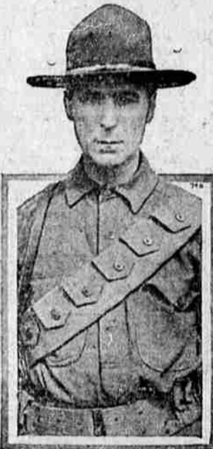
WILLIAM S. HART in "The Border Wireless"

BILL HART AT THE LIBERTY TODAY AND TOMORROW