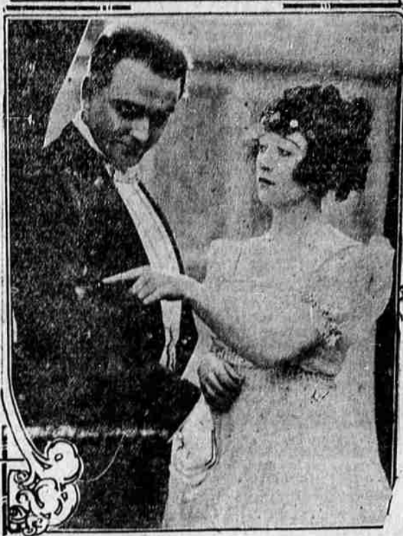
Scene from "Mickey," which made such a tremendous hit at the Rialto yesterday. It will be shown again today and tomorrow.