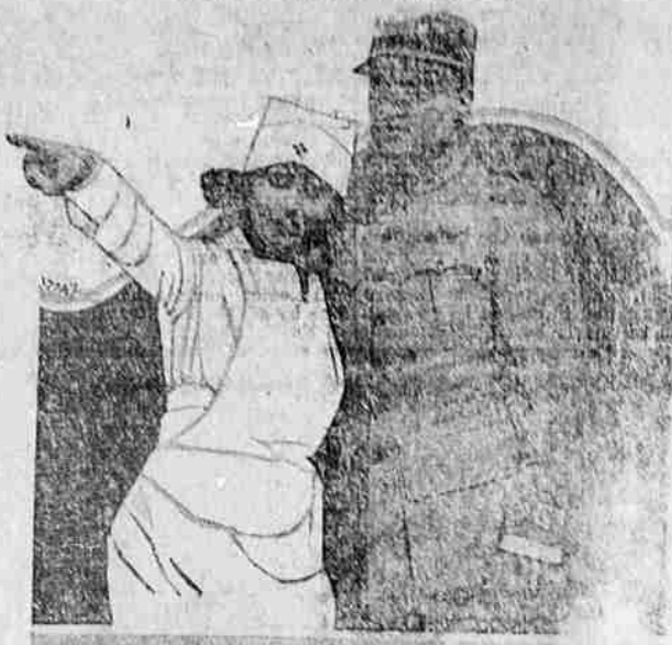
The bright road to the future. DOROTHY DALTON A Paramount Picture