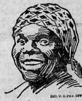
"I've in town, Honey!"

to make buckwheat cakes—if you make them the easy Aunt Jemima way! All you need is a package of Aunt Jemima Buckwheat Flour—you add nothing but water. Everything necessary to make the best buckwheat cakes you've ever tasted is already mixed in the flour. Order a package of Aunt Jemima Buckwheat (in the yellow package) from your grocer and give your husband this wonderful old-time breakfast tomorrow! Aunt Jemima Mills Company, St. Joseph, Missouri.