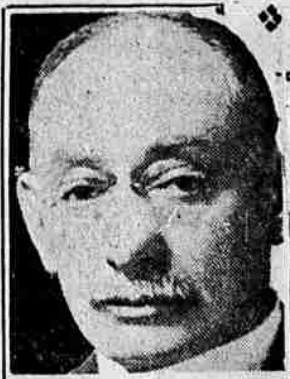
WALTER HINES PAGE