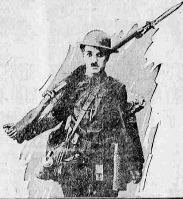
Charlie Chaplin IN HIS SECOND MILLION DOLLAR PICTURE "SHOULDER ARMS"