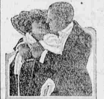
CECIL B. De MILLE'S "We Can't Have Everything" An ALLIANCE Drama

How it is done in some picture studios, is shown in "We Can't Have Everything," at the Liberty theatre tonight. This is a special Cecil B. De Mille production for Artercraft and is based upon Rupert Hughes' novel of the same name. The scenario is by his brother, Wm. C. De Mille. The incidents which show the inner workings of a film studio occur