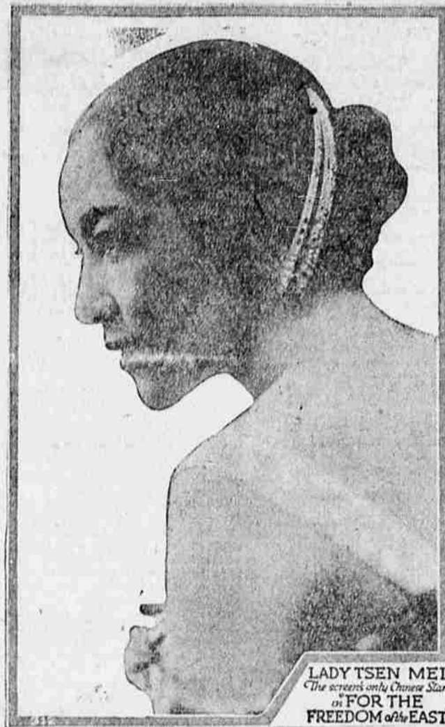
LADY TSEN MEI The screen's only Chinese Star of 'H ORIENT' FOR THE FREEDOM OF THE EAST

The first Chinese screen actress to rise to stellar fame is Lady Tsen Mei, who seeks public acclaim thru "For the Freedom of the East," a cinema drama of compelling patriotic power, at the Rialto tonight and tomorrow.