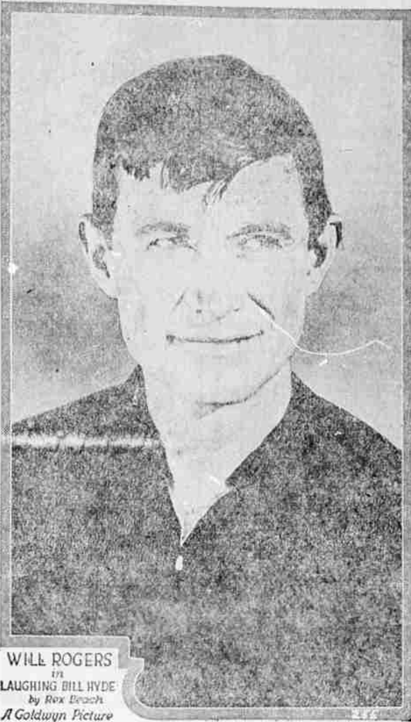
WILL ROGERS IN LAUGHING BILL HYDE by Rex Beach A Goldwyn Picture

Will Rogers, noted Ziegfeld "Follies" favorite, who wields witticisms along with his lasso, triumphs in his first appearance in motion pictures in the name role of "Laughing Bill Hyde," a powerful Rex Beach Goldwyn production, at the Rialto tonight and tomorrow.