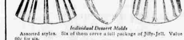
Individual Dessert Molds Assorted styles. Six of them serve a full package of Jiffy-Jell. Value 60c for six.