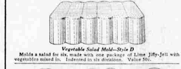
Vegetable Salad Mold—Style D Molds a salad for six, made with one package of Lime Jiffy-Jell with vegetables mixed in. Indented in six divisions. Value 50c.