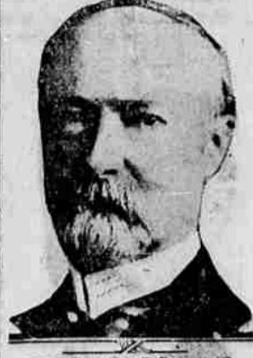
CHAS. W. FAIRBANKS

INDIANAPOLIS, Ind., June 4.—The condition of Charles W. Fairbanks, former vice president of the United States, was so critical this afternoon that his attending phys-