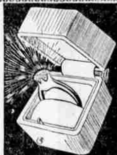
If in a Reddy Box it's all right.

QUALITY FIRST. Visitors Always Welcome. Phone One-O.