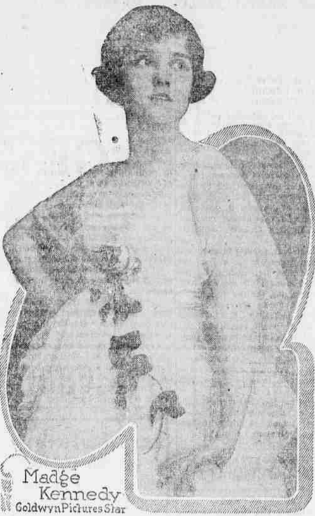
Madge Kennedy Goldwyn Pictures Star