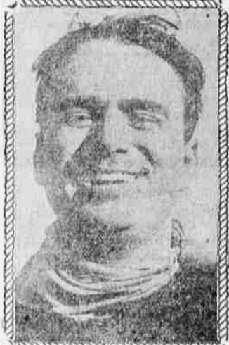
Douglas Fairbanks in Double Trouble, a de luxe edition of one of the peppy boy's greatest successes. It is taken from Herbert Quick's novel of dual personality, and Douglas sure does know how to put it over. He will open a two-day engagement at the Star theatre today.