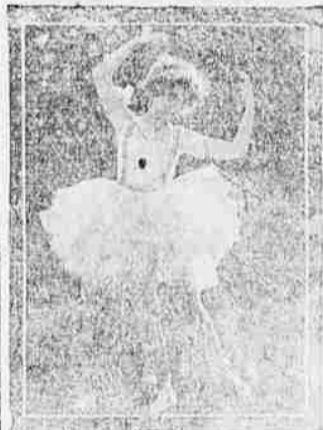
Bessie Love in Triangle Play "The Sawdust Ring"