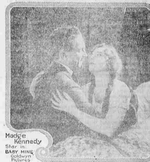
Madge Kennedy Star in BABY MINE Goldwyn Pictures