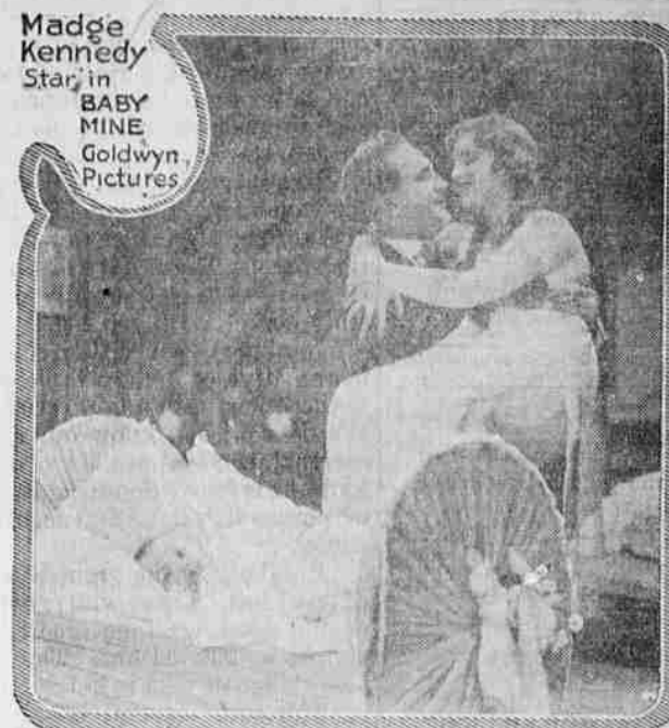
Madge Kennedy Star in BABY MINE Goldwyn Pictures