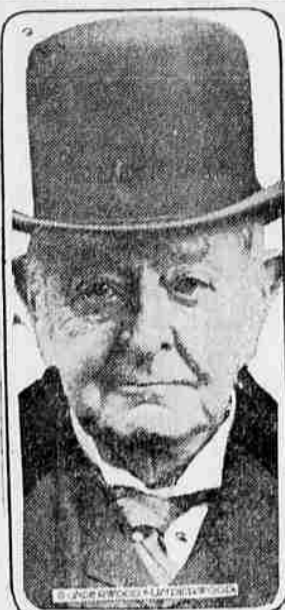
JOSEPH H. CHOATE

Highest Paid Lawyer. His professional income during the height of his career was believed to be the largest of any practitioner in the American courts, though it may occasionally have been surpassed by some of the huge fees paid for special services by some of the great corporations. He won his way through a combination of good humor which gave him the power to hold the attention of the juries in the duller cases, and legal skill.