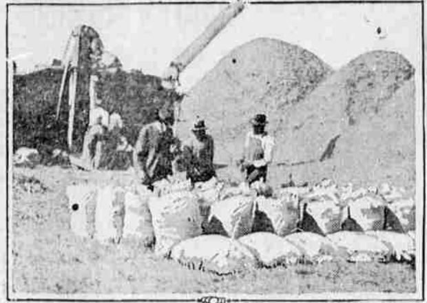
Threshing rice on one of the large rice farms of Arkansas, with part of the crop already in bogs.

LITTLE ROCK, Ark., March 12.—The rice industry of Arkansas is booming along as fast as land can be taken up and cultivated.