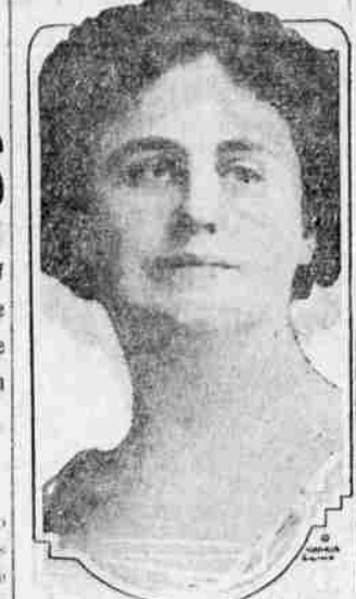
Mrs. Woodrow Wilson

Mrs. Wilson was the first woman in the history of the United States to stand beside the president when he repeated his oath, March 5. Until then the most imposing part ever taken by woman in inauguration ceremonies was that of Mrs. Taft, eight years ago, when she rode down Pennsylvania avenue with her husband. She went as far as the senate where the ceremonies were held, but did not accompany him to the rostrum.