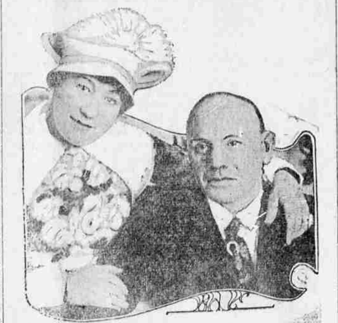
Mr. and Mrs. Bob Pitzsimmons, snapped in San Francisco where "Bawb" was seriously considering his wife's request that he become an evangelist.

By E. L. Moriarty Bob Pitzsimmons, who 20 years ago this month won the heavyweight championship from Jim Corbett, is approaching his latest contract with fear and trembling. In fact, Sir Robert is not sure that he can make weight. For the first time in his life it may be necessary to drag the mighty Cornishman into the ring. And there's a reason.