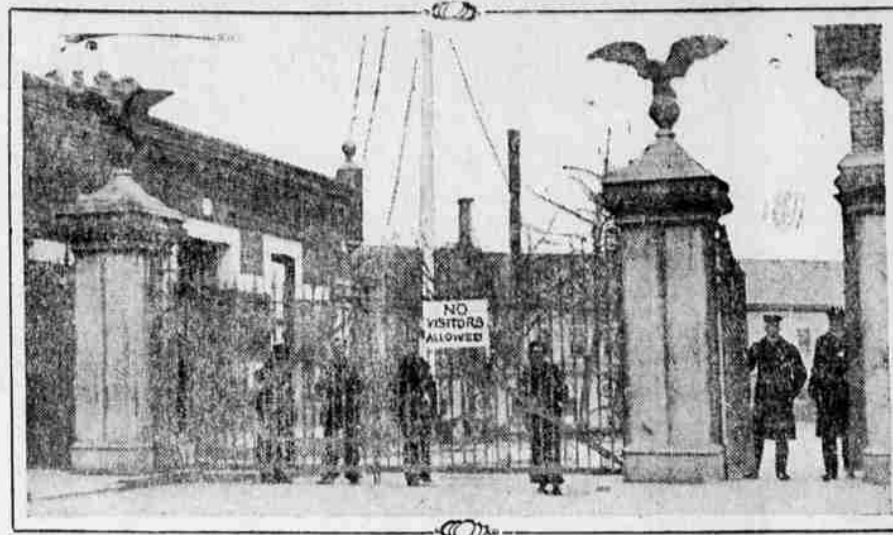
Guards have been placed at the entrance of Uncle Sam's navy yard at Brooklyn, since diplomatic relations were broken with Germany, and only employed, with cards, are allowed to enter or leave.