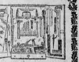
This cabinet, K-9, would make a magnificent gift for the man of your house; complete with 45 tools, $40.00

Keen Kutter Cutlery and Tools are sold in every city in the country and in most all towns and villages. You can't go wrong in giving Keen Kutter goods—they're guaranteed to satisfy or money refunded. Booklets giving full information on any of above articles gladly mailed on request.