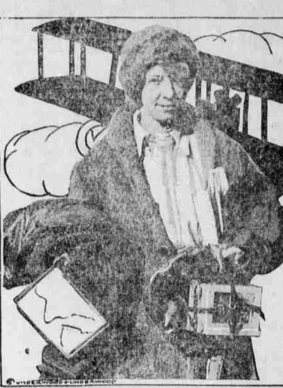
Auth Law is getting ready for another record breaking aeroplane flight from Chicago to New York. She will use a monster new aeroplane of latest design.