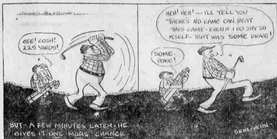
BUT A FEW MINUTES LATER HE GIVES IT ONE MORE CHANCE