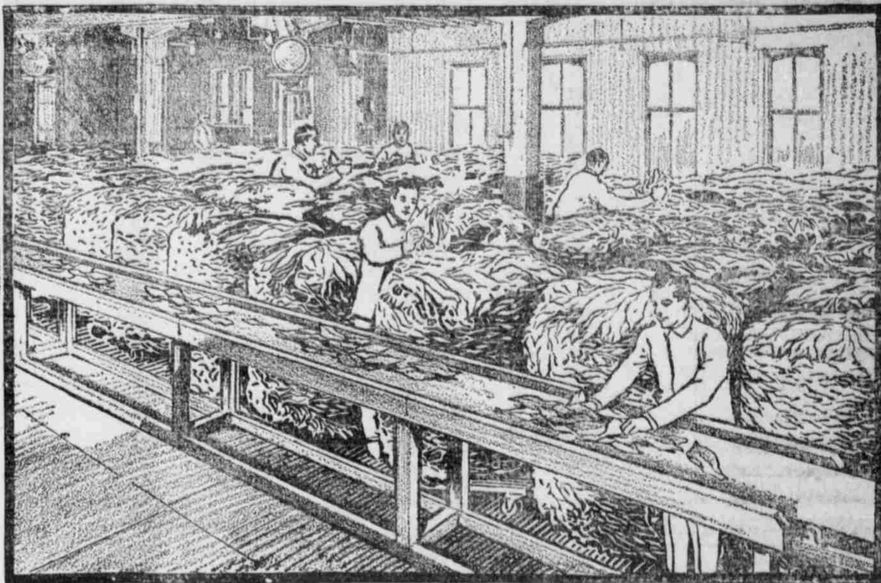
Where the Golden Virginia-Carolina Leaf for "Bull" Durham Starts on Its Journey.