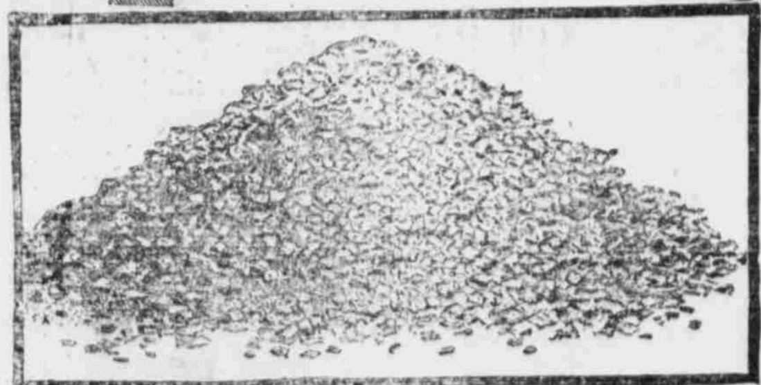
After it Has Passed Through the Sieves—the Finished Flakes.