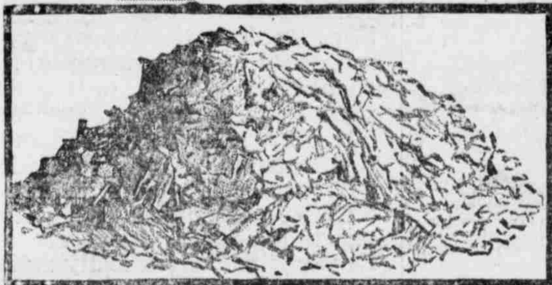
After It Has Passed Through the Third Granulator.