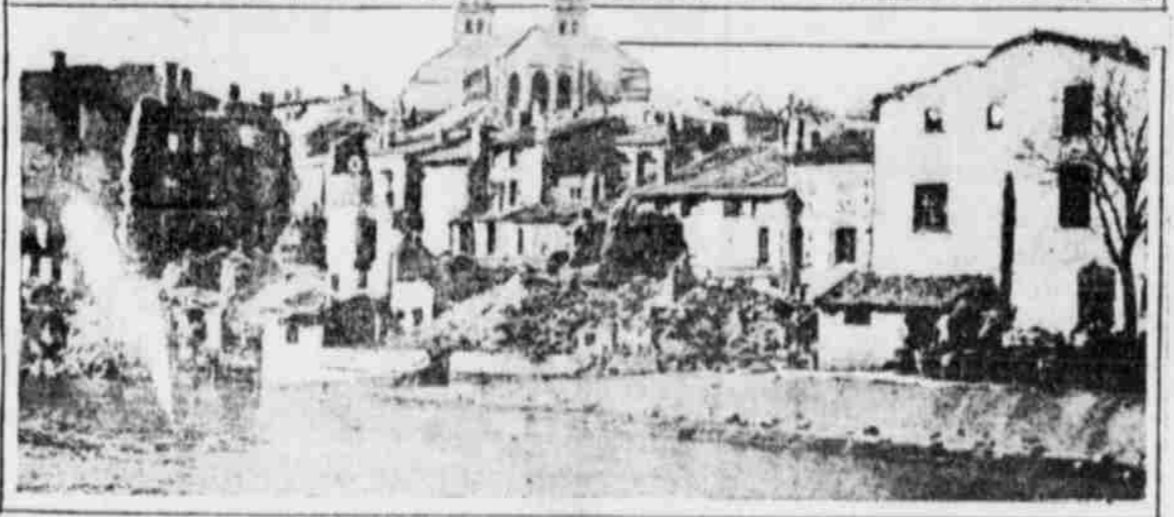
Before the battle of Verdun started, the city of Verdun on the Meuse river in France, looked as shown in the picture above. After the battle raged more than 100 days, Verdun looked as shown in the picture below. Each picture was taken from the same spot. The buildings on the hill sloping away from the river have been reduced to ruins by German shells, with only here and there a wall standing, as shown in the photograph. These trees in the picture above are not visible in the picture below. They were felled and completely buried under debris. The battle, already the longest in world history, is still on.