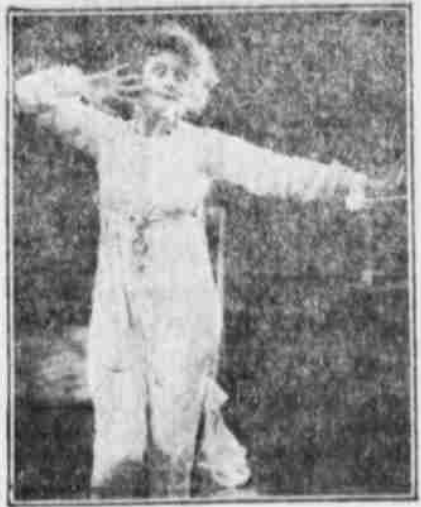
Billie Burke in Pajamas in the New Triangle-Fine Arts Romantic Comedy "Peggy."