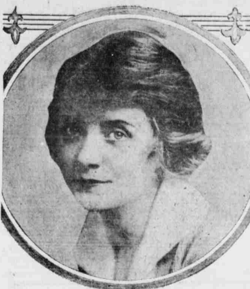
Billie Burke, the winsome will-o'-the-wisp creature with the wonderful smile, who will appear at the Page in "Peggy" Sunday and Monday, June 11 and 12.