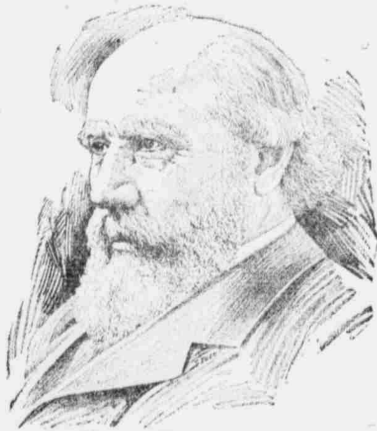
JAMES J. HILL

ST. PAUL, Minn., May 26.—Dr. William Mayo, surgeon of Rochester, Minn., is being rushed to St. Paul on special train to attend James J. Hill, who is ill at his home here.