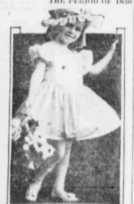
Everybody looks at the bride. But nobody ever overlooks the flower girl, so her frock must be in the latest mode.

A veritable little 1916 Miss is the flower girl of this season with long waisted and short skirted dress.