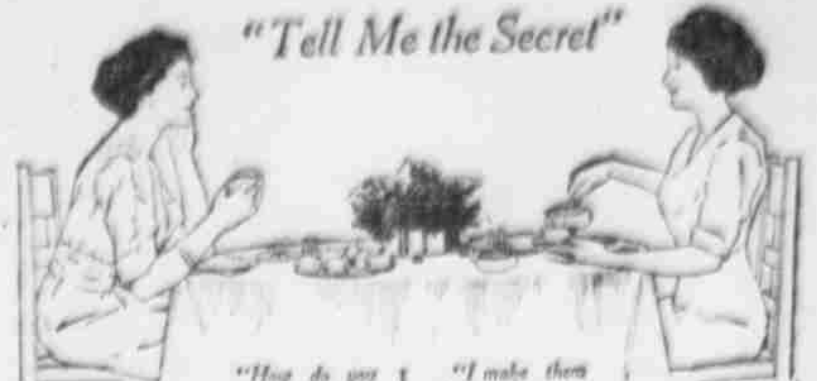
"Tell Me the Secret"

The inventors believe they have constructed a rigid airship one-third lighter than it is possible to build a Zeppelin of the same size. The hull and car weigh 2190 pounds. The total weight of equipment, crew and engine is 5500, leaving a margin of 1300 pounds for ballast, explosives and additional fuel.