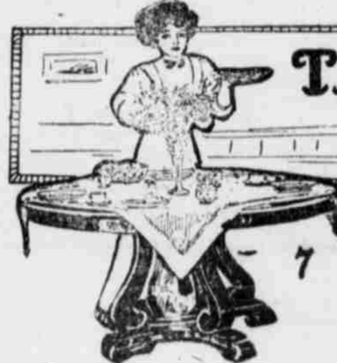
TABLE LINEN SALE

$1.25 AND $1.35 GRADE TABLE LINEN AT $1.05