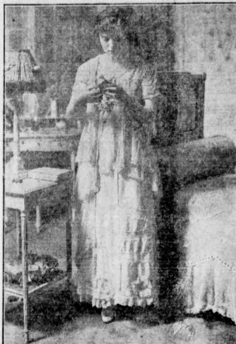
"Twin Beds" has been unanimously declared by the newspaper critics to be the cleanest and funniest farce the American stage has known since "Ruby Mine," which also came from Margaret Mayo's pen, and its presentation here is certain to prove one of the delights of the year.

The Iowa Society has postponed its proposed banquet and social gathering to Monday evening, December 13, at which time it will be prepared to enjoy a happy and interesting assemblage and program.