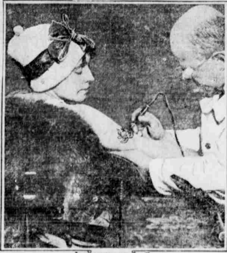
Here is the latest wrinkle for which future generations will be able to blame the war. This English girl is having the badge of her soldier sweetheart's regiment tattooed on her arm.

myself, entails the careful examination of the charter and ordinances of the state of Oregon, the briefing of all cases bearing on the subject in hand, the preparation of ordinances and other necessary papers embodying legislative acts necessary to put the plan into effect, the accumulation in detail of all accessible preliminary data, and involves, for my own safety, the submission of the whole proposition for final analysis and decision as to legality, to competent authority.