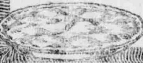
"Cottolene makes good cooking better"

Write our General Office, Chicago, for a free copy of our real cook book—"HOME HELPS."