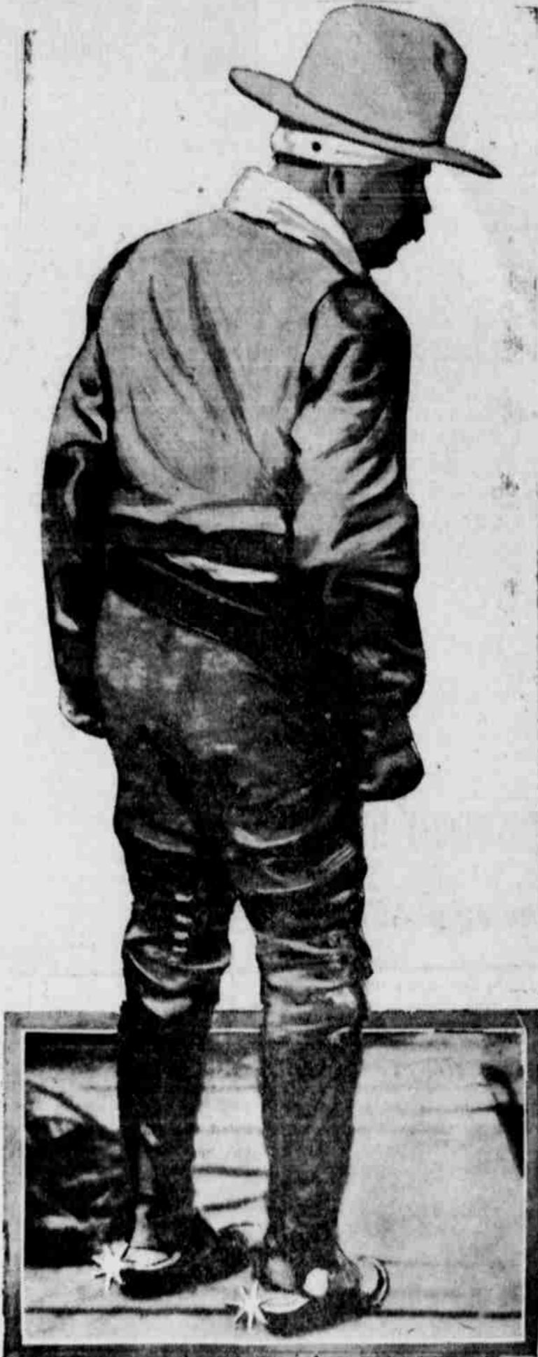
Pancho Villa in his camp in Chihuahua.