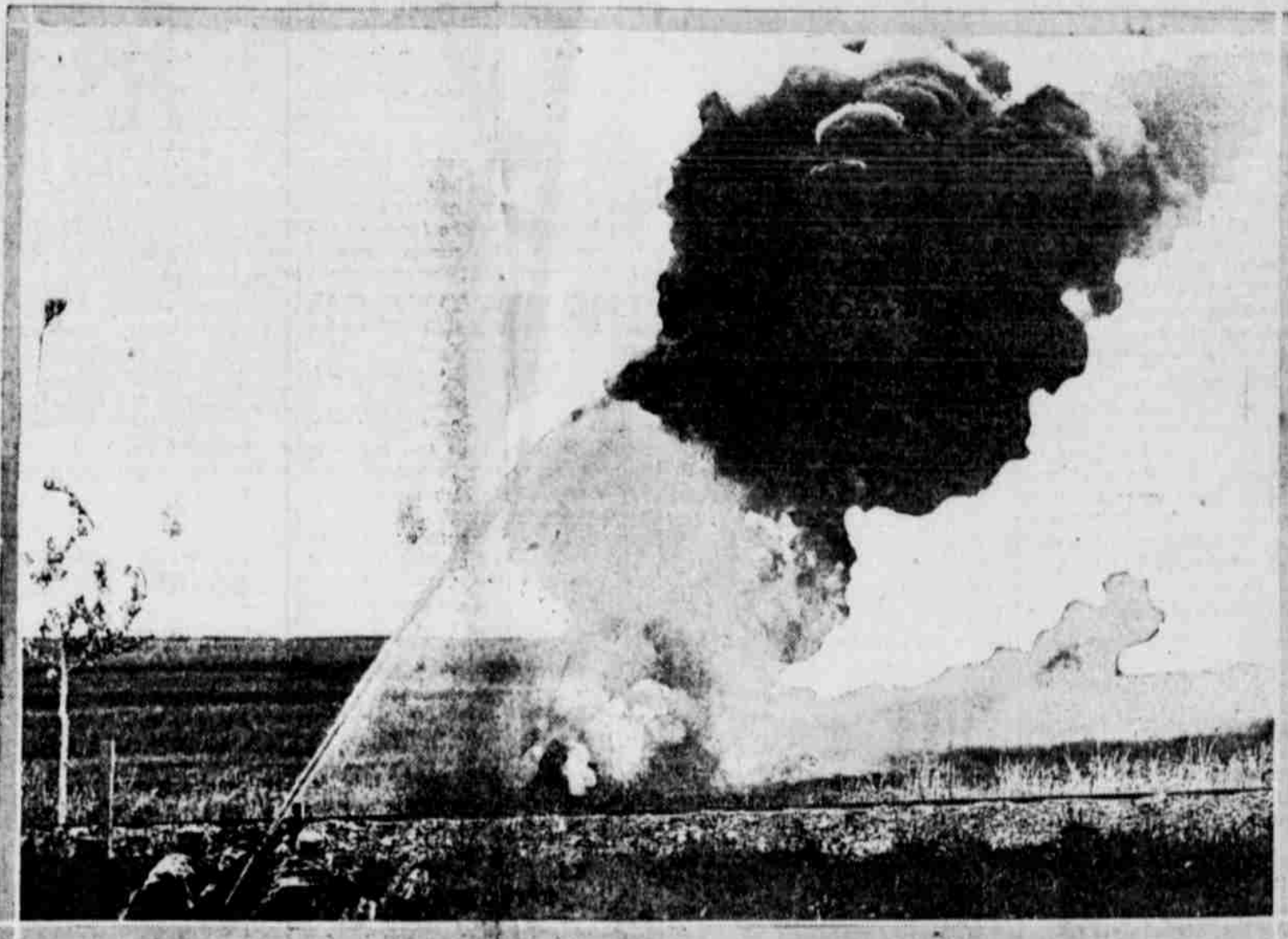
This remarkable photograph portrays vividly the newest French war device throwing devastating flames over the German trenches. Note the tree, almost beside the muzzle of the apparatus, unharmed by the flood of burning death.