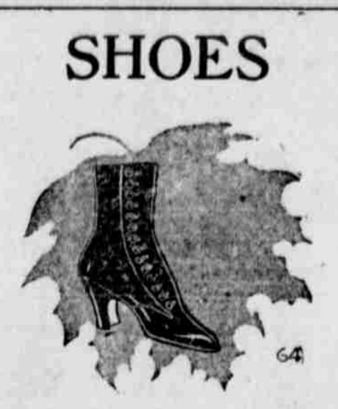
The family shoe store, where every member of the family can be fitted. Our qualities speak for us and sell our shoes.

While all the three Scandinavian police said, contained details of twennationalities usually understand each ty six incendiary fires in Pacific other in the ordinary conversation, coast cities during the last few years it is not so easy to fully grasp the on which the gang is said to have meaning of the expressions as used made an evareg profit of $600 each. meaning of the expressions as used made an evareg profit of $600 each.