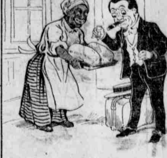
No. 2—Taking pity on him, I hastily prepared some magic powder. I then hired a cook to demonstrate this marvelous yeast in a store window!