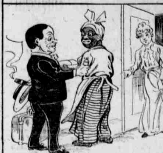
No. 1—Once I found a poor man struggling to place his new yeast on the market. On every hand, his powerful competitors fought him!