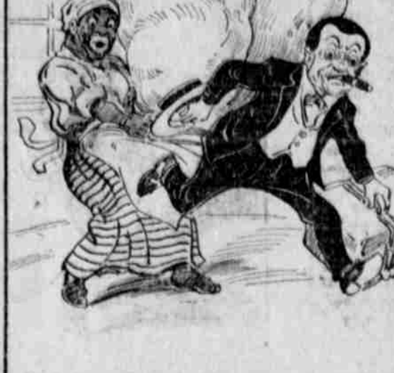
No. 3—However, when I sprinkled my powder on the first two trial loaves, they swelled up in a jiffy to enormous size! The cook went suddenly insane!