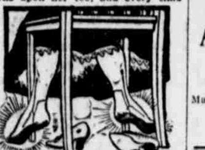
Stop Misery and Embarrassment Like This With Simple, Easy "Gets-It."

The Big Surprise for Corn Owners. It's Sure, Simple, Safe, Quick. Listen to the real story of "Gets-It," the world's greatest corn remedy. It's a short story—only about two feet— "Mary had a little 'Gets-It' and corns upon her toe; and every time she put on 'Gets-It' the corn was sure to go." Mary, like thousands of others, used to be a heroine, suffering martyrdom, using painful bandages, irritating salves, sticky tapes, toe-harnesses, blood-bringing razors and scissors. She says now there's no sense in it. Use "Gets-It" applied in 2 seconds. Easy, simple, new way—just painless common sense! Millions are doing it. Never fails. You can wear similar shoes now. You don't have to limp around any more, or walk on the side of your shoes to try to get away from your corns! You know for sure before you see "Gets-It" that the corn or callus is going away. For corns, calluses, warts and bunions. "Gets-It" is sold by all druggists, ice-a-bottle, or sent direct by E. Lawrence & Co., Chicago.