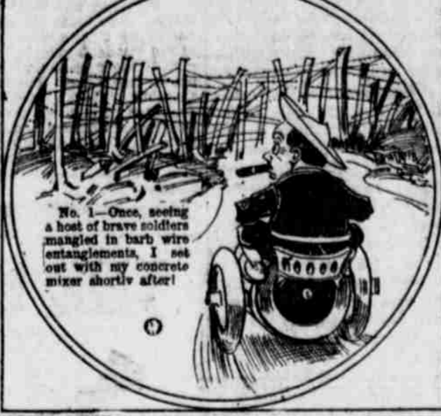
No. 1—Once, seeing a host of brave soldiers manning in barb wire entanglements, I set out with my concrete mixer shortly after!