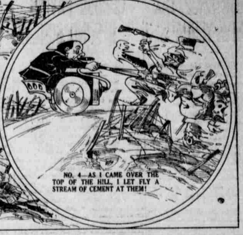
No. 4—AS I CAME OVER THE TOP OF THE HILL, I LET FLY A STREAM OF CEMENT AT THEM!