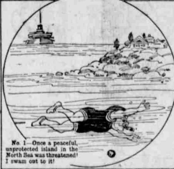
No. 1—Once a peaceful, unprotected island in the North Sea was threatened! I swam out to it!

NICK TOW? FLOATING ISLAND! STRANGE UNDERWATER VOYAGE!