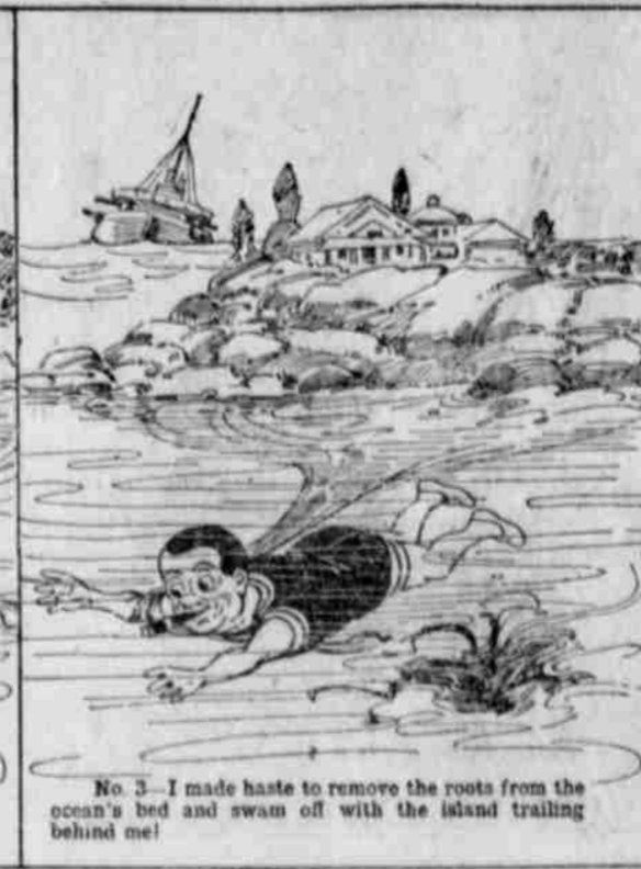
No. 3—I made haste to remove the roots from the ocean's bed and swam off with the island trailing behind me!